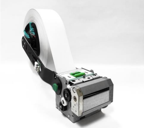
Optional supply holder